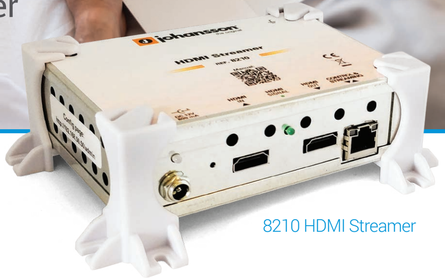
8210 HDMI Streamer

The all-in-one streaming solution that allows you to easily stream your content.